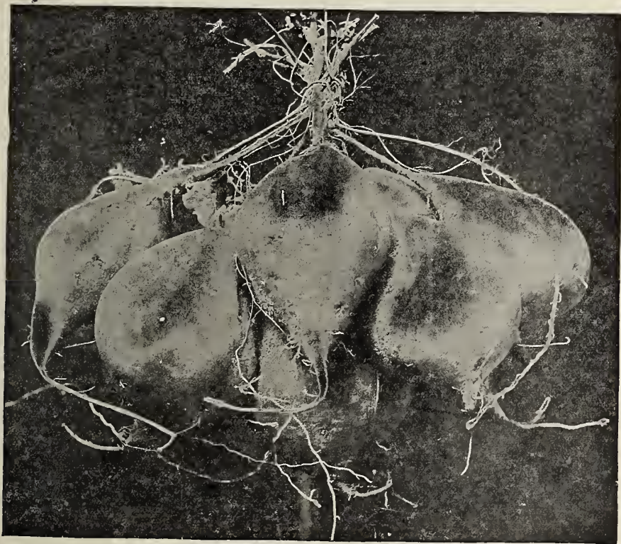
OUR LEADER (THE JERSEY YELLOW)

(See next page for prices and plant culture)